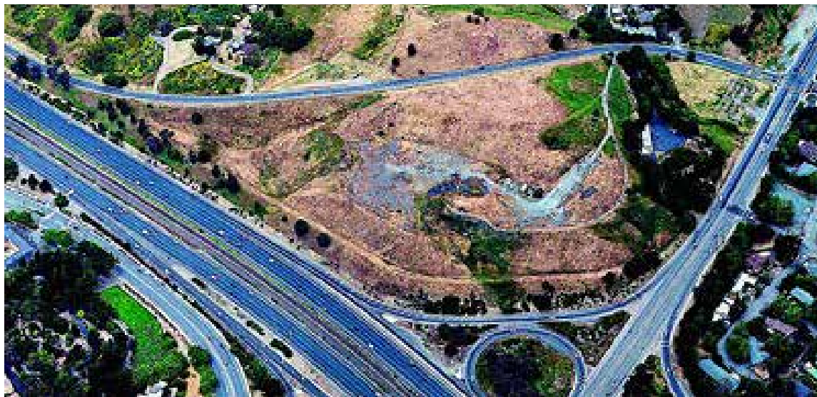
Aerial view of the Deer Hill Road development site.